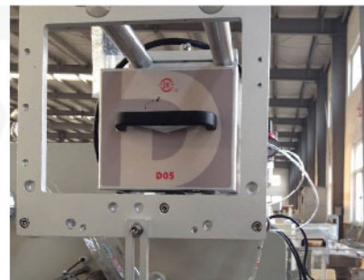
D05 installed on FFS Machine